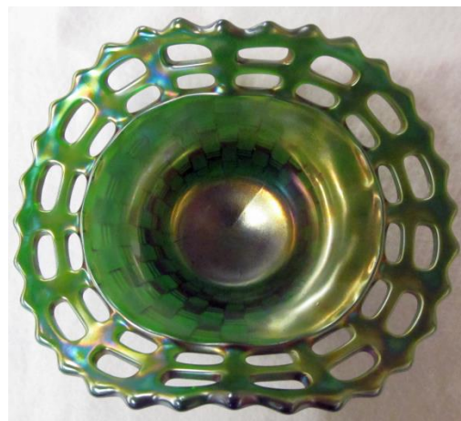
(right) Fenton's Two Row Two Sides Up Basket in Emerald Green