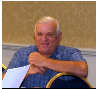
Clint...all I can say is, "I Gotcha!"